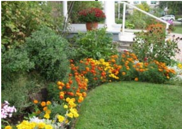
The left front garden