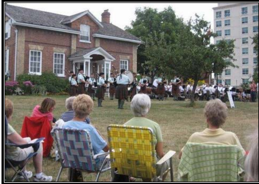
The Scarborough Pipe Band in action

This past summer marked our 17th season of Twilight Concerts-In-The-Park offered free to the general public. This concert series was made possible by the Etobicoke Community Concert Band, the Scarborough Pipe Band and the Toronto All-Star Band that played big band and military music to average crowds of 200-300 on four separate nights during the summer months. We again had financial support from last year's sponsor, Origin Evergreen, that we greatly appreciated.