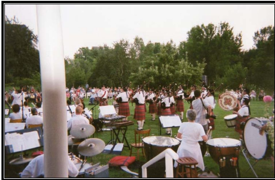
Stirring entertainment by the Etobicoke Community Concert Band, together with the Scarborough Pipe band, as seen from the front porch of the Homestead