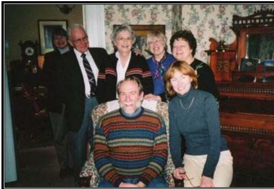
The last meeting of the Applewood Furnishings Committee 1983 - 2008